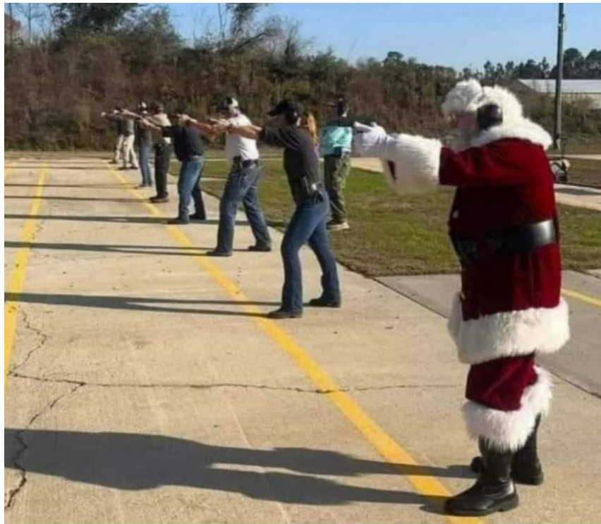
Santa Claus training for his ride through Chicago this year.