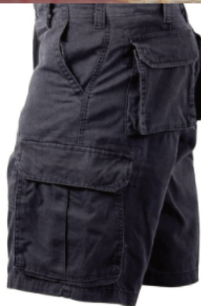
high capacity assault shorts